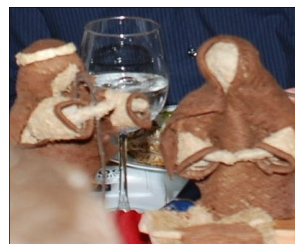
Nativity sets from various countries were centered on each table.

Without question, the highlight of each year has been the annual banquet in December. This year's banquet was another huge boost. Just walking in the door, Christmas decorations, lights, and candles, placed an immediate focus on Christ and our ability to celebrate His coming. The 40 tables, each with a nativity centerpiece from a different country around the world, were a great reminder that the coming of Christ is celebrated in thousands of languages and cultures around the world. The furloughing missionaries we serve are making this Good News known to the many that have yet to hear.