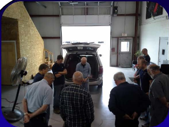
The Righteous Rides team prays with a furloughing missionary—the core of what we do.