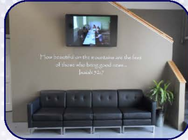
The Righteous Rides lobby– before (L) and after (R).

As we continue in our pursuit of providing reliable transportation for furloughing missionaries, our hope and prayer is that every person who walks through the doors of Righteous Rides would immediately feel loved and encouraged– whether that person is a missionary picking up or returning their van, or someone from the general public looking to purchase a donated vehicle.