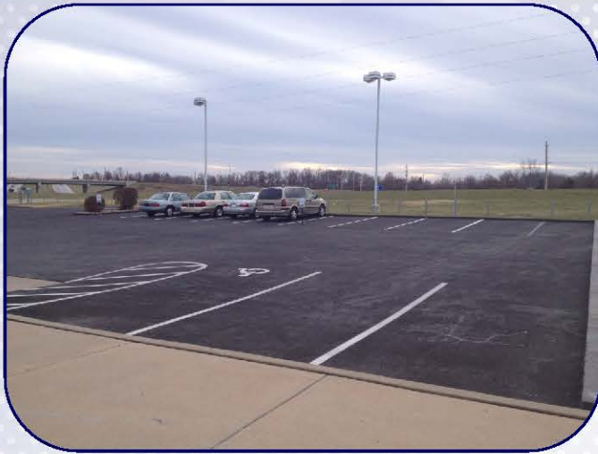
Vehicle donations have decreased in 2014, leaving our "Front Line" (where we sell donated vehicles) with quite a few open spots.

The fees missionaries pay to use a Righteous Rides van typically cover around half of the actual operational cost of the van. That being said, how does Righteous Rides make up for the other half? Additional funds come from generous donors, as well as the sale of donated vehicles.