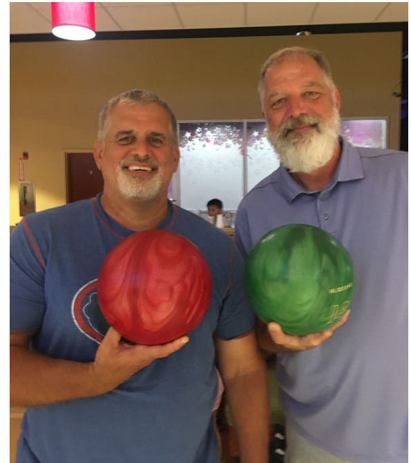
Marshall with an older brother

Galatians 6:10 "...whenever we have the opportunity, we should do good to everyone –especially to those in the family of faith."