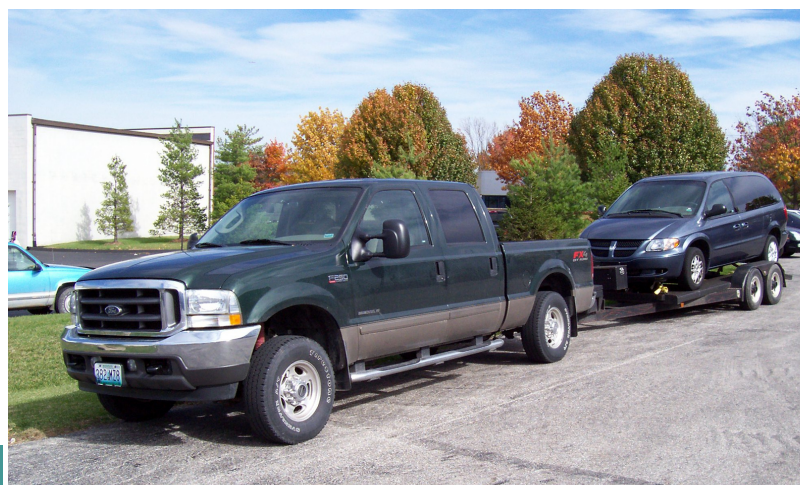
"Proud Mary" served Righteous Rides missionaries in the early years, delivering ready vans and rescuing crippled ones.