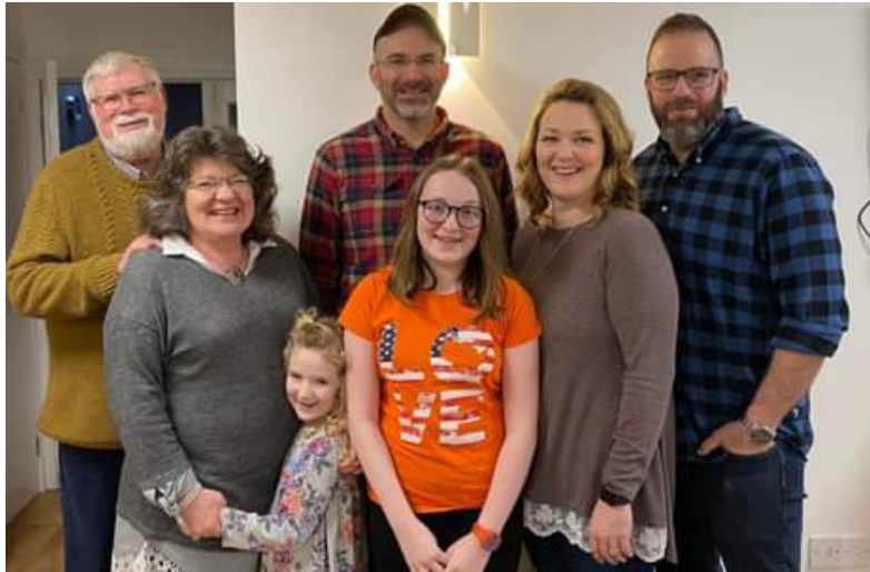
Three generations benefit from Righteous Rides vans.